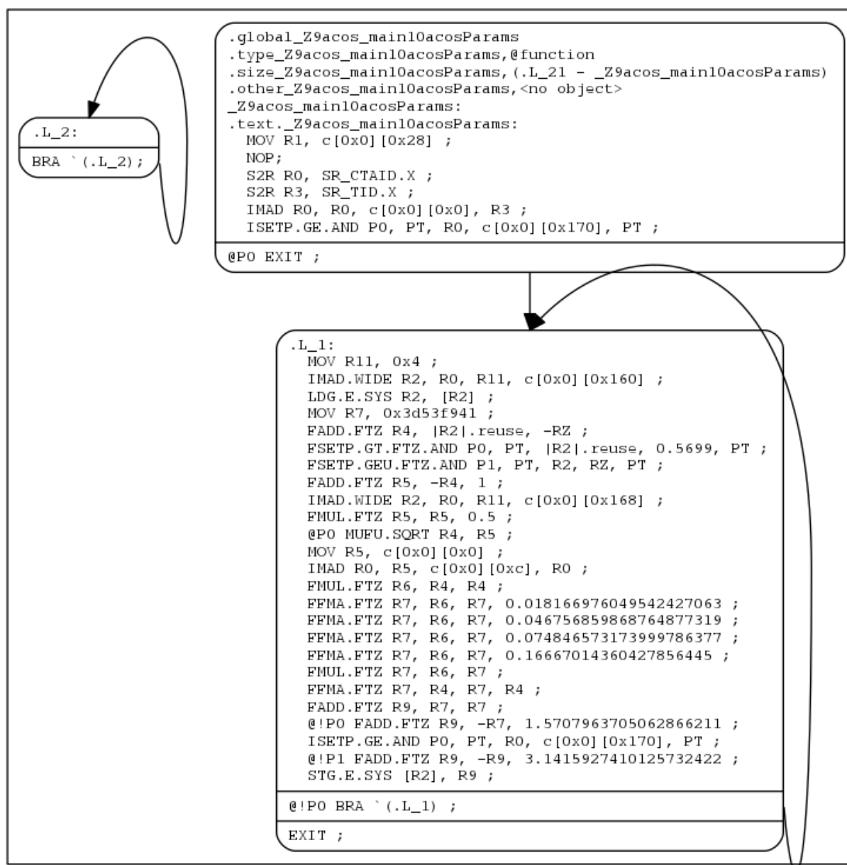
Fig. 1: Control Flow Graph